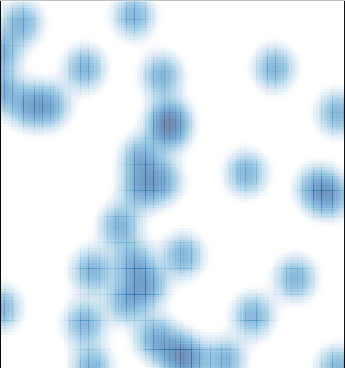
# features = 37 , max = 1